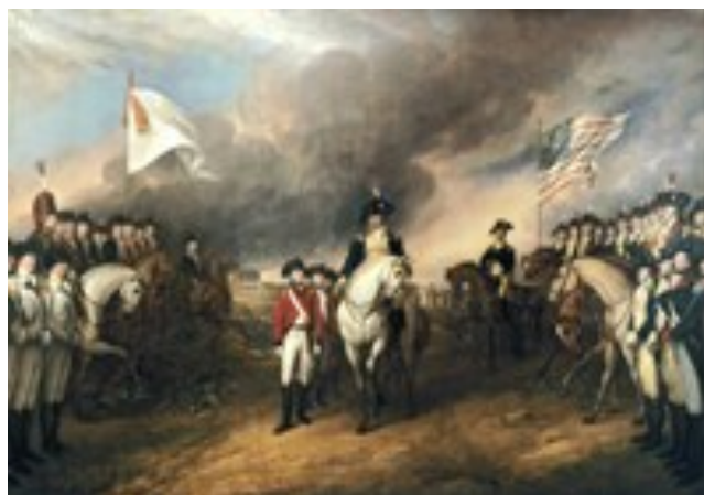
VICTORY AT YORKTOWN

General Washington was ready to attack New York City when word reached him of Admiral De Grasse's departure from the West Indies toward the Chesapeake Bay. As Washington's troops headed south, Lieuten-