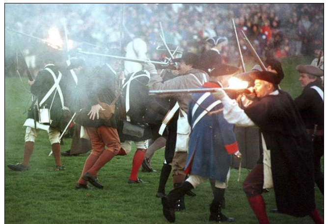
April 19, 2015, re-enactors on the Lexington Green.

Capt. John Parker, commander of the 77-member Lexington militia, had met the 700-strong British column on the green at 5:30 a.m. Eight of his men were killed and 10 wounded. Undaunted, Parker planned his revenge, positioning his remaining men on a rocky hillside on the border of Lexington and Lincoln and awaiting the return of the British early in the afternoon.