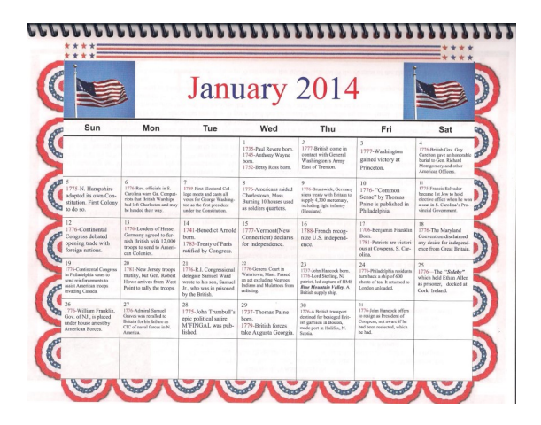
A look at January and the historic data for each day.

mock copy to the State Meeting and it was decided at that time with all the historical information included in his calendar that he would charge $20 per copy. This would be enough to cover his costs and any mailings that were needed. The remainder of all proceeds after costs are paid for will be donated to the CAAH (The Center).