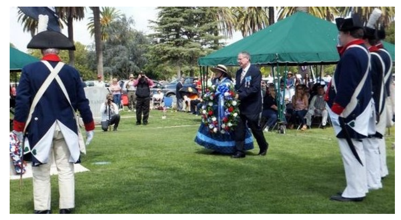
On May 27th your Lee's Legion Color Guard presented the Colors (left) and a wreath (above) during the Memorial Day ceremonies at the Old Santa Ana Cemetery